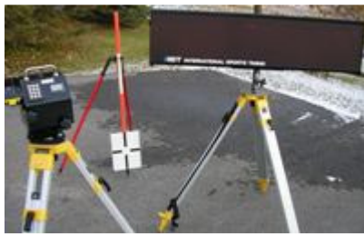
LASAM® system and scoreboard with its own tripod: $8500

LASAM® Setup with Target, Tripod, Disto Laser. Total system place in remote location, measure by triangulation