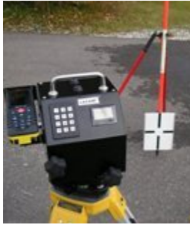
LASAM® System: $7014

LASAM® Setup with Target, Tripod, Disto Laser. Total system place in remote location, measure by triangulation