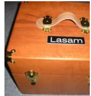
LASAM® System carrying case

LASAM® | Laser Measuring | Track Equipment | Measuring/Gauges | Equipment for the Track | About Us | Contact Us