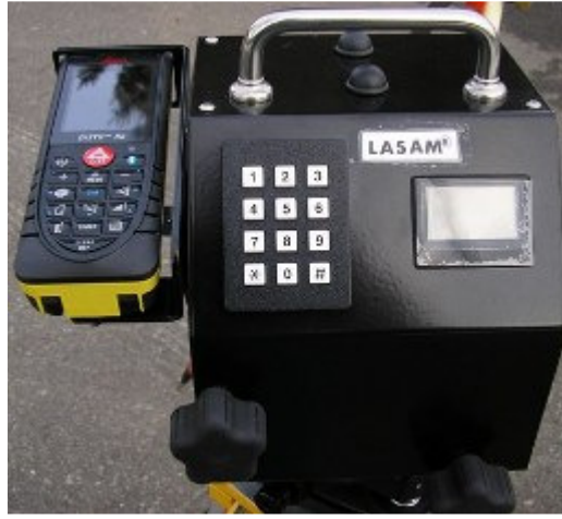
Close-up of LASAM®